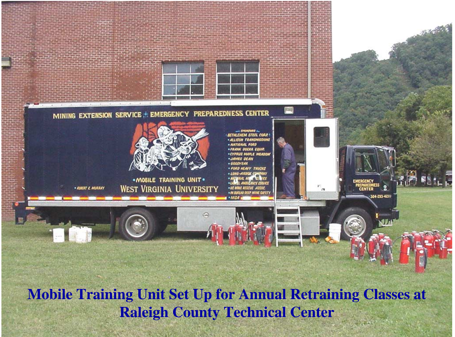
Mobile Training Unit Set Up for Annual Retraining Classes at Raleigh County Technical Center