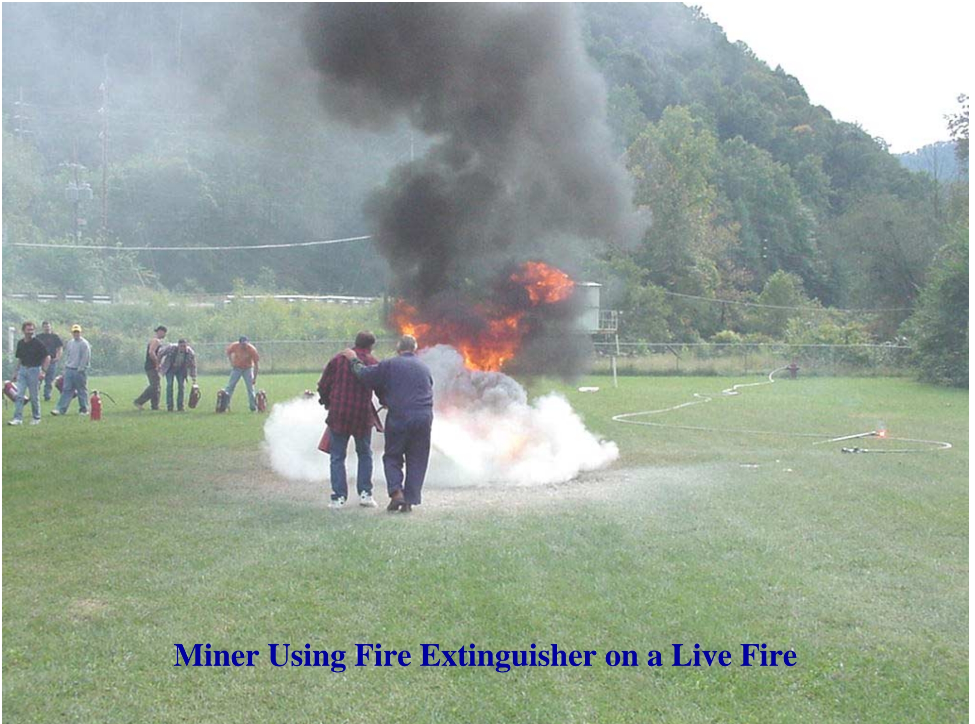
Miner Using Fire Extinguisher on a Live Fire