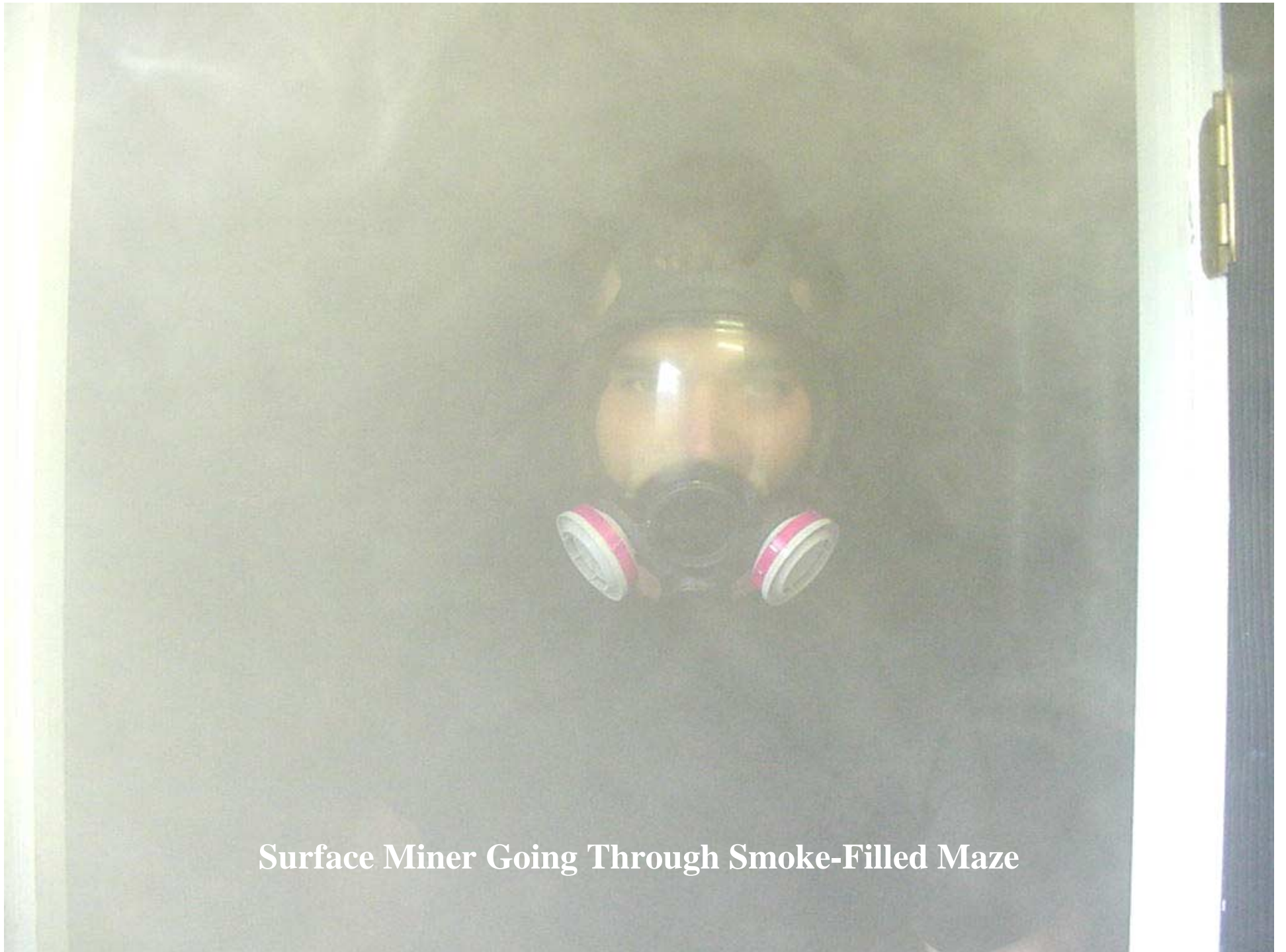
Surface Miner Going Through Smoke-Filled Maze